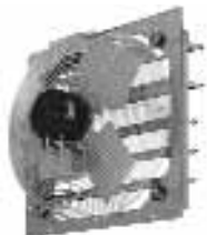
SEF SHUTTER MOUNT FAN

READ AND SAVE THESE INSTRUCTIONS FOR FUTURE REFERENCE